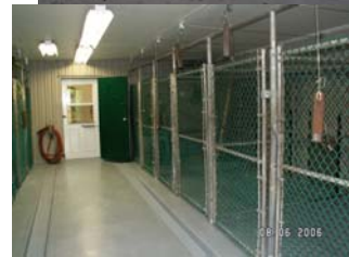
Pictures of the outside and inside of Mass Humane Society Animal Shelter in East Weymouth, MA