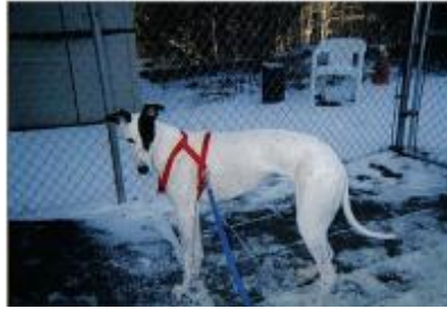
Aspen – Female greyhound found a nice home.

Massachusetts Humane Society is working with the Greyhound race tracks in Massachusetts. The Mass Humane Society has retired Greyhounds from the race track. These Greyhounds are beautiful natured dogs UP-FOR-ADOPTION. The dogs will be at our Mass Humane Society Animal Shelter in East Weymouth, MA. These Greyhounds ARE READY FOR THERE FOREVER HOME WITH LOTS OF TLC. Please call Mass Humane Society at 781-335-1300 or email masshumane@aol.com for MORE INFORMATION on the Greyhounds at our shelter. Mass Humane is networking with GPA of Mass.